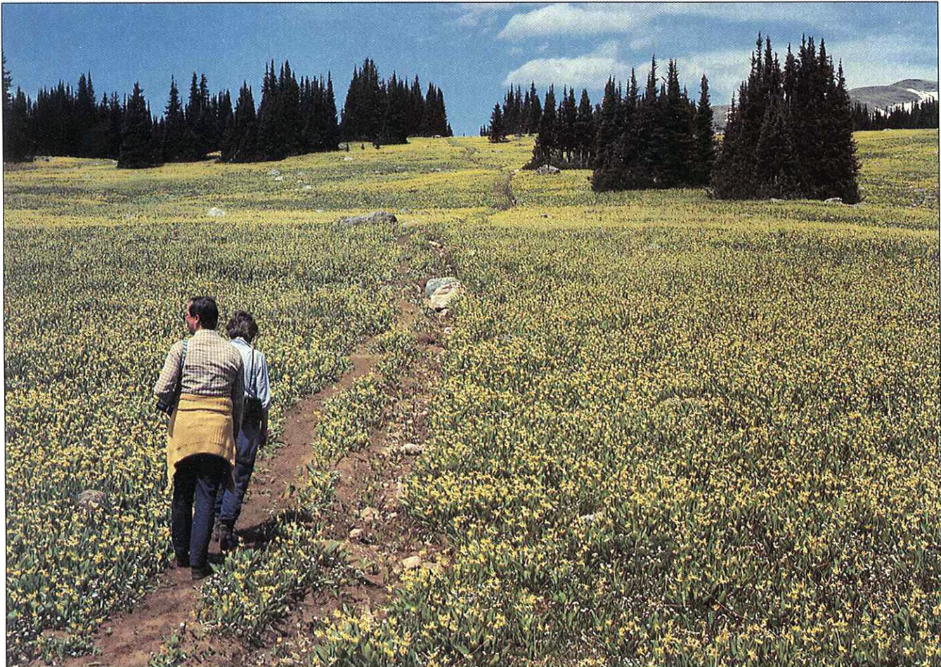
T. GOWARD/TROPHY MEADOWS